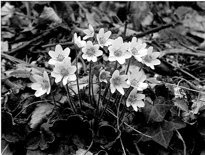
Heptatica nobilis var. japonica f. magna

Toki Messe (venue) http://www.niigata-bandaijima.com/